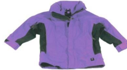
Suitable coat with a hood