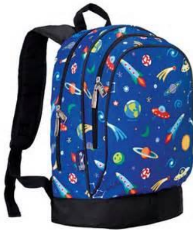
School bag with spare clothing