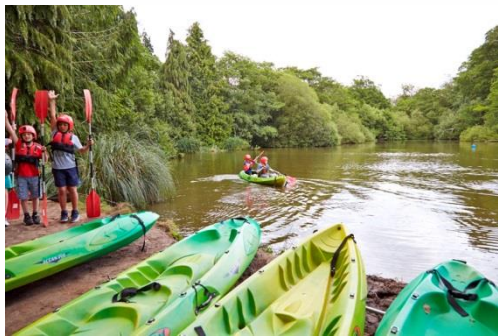
Water Sports Lake