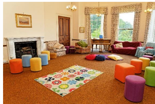
Kids Common Room